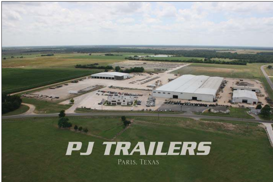
PJ TRAILERS CORPORATE HEADQUARTERS PARIS, TEXAS