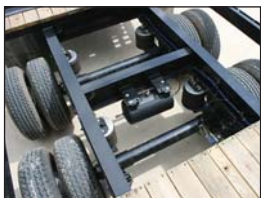
TRAILER FLEX TrailerFlex Air Ride Suspension