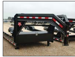
12" I-Beam Gooseneck (C8) 24+ ft only