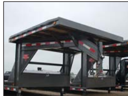
Deck on the Neck (GN Only)