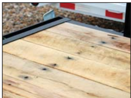
Rough Oak Floor