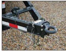
3" Pintle Eye