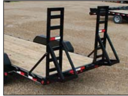
Straight deck w/ 5' Fold-up Ramps