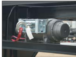
Winch 12VDC (12,000 lb.)