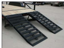
2' Dovetail w/ HD Fold-up Ramps