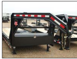
8" I-Beam Gooseneck (CC)