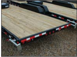
Straight deck w/ 5' Slide-in Ramps