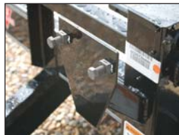
Spare Tire Mount