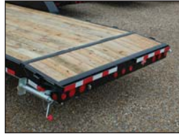
2' Dovetail w/ 5' Slide-in Ramps