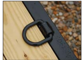
1 Pair D-Rings