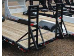
2' Dovetail w/ 5' Fold-up Ramps