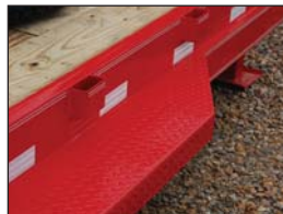
Diamond Plate Running Boards