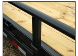
2 3/8" Pipetop Removable Siderails (CC, C8)