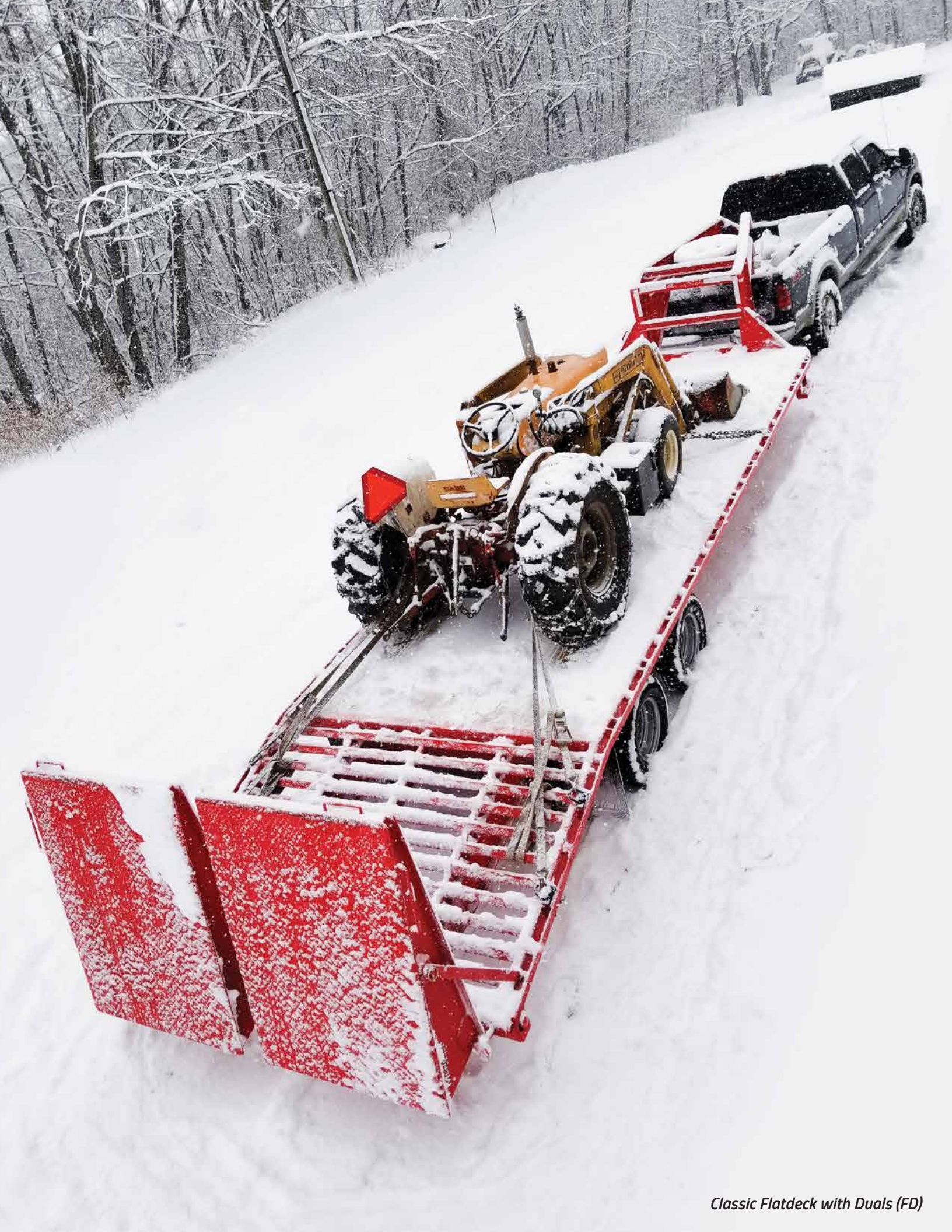
Classic Flatdeck with Duals (FD)