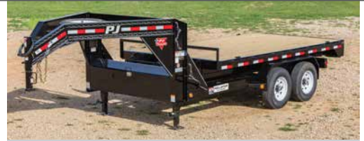
Rollster™ pictured with Roll Off Deck (RD)